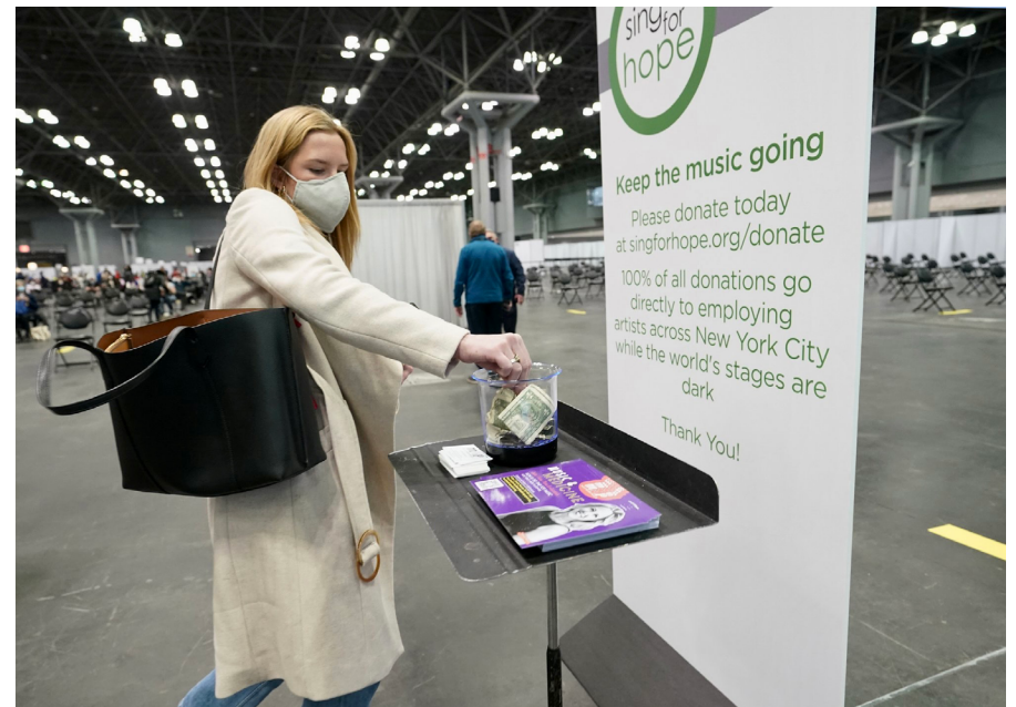
A community member with a Sing for Hope banner at Javits Center Vaccination Site, NYC

#SingForHope #SingForHopePianos #ArtForAll #ArtsForAll #ArtsUnite #ArtsTransform #Arts #Creativity #Pianos #ArtPianos #VisualArtist #VisualArtists #SFHPianos #StreetPianos